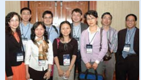
Some members of the Association