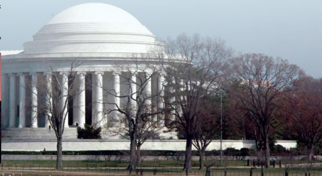
The Jefferson Memorial