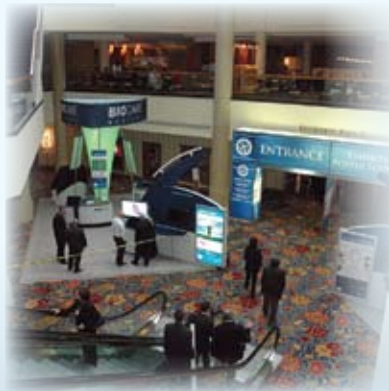
The trade display opened on Monday March 22.